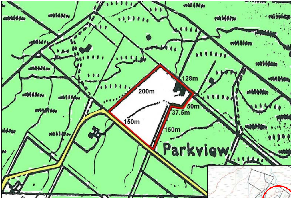
This plan is intended to illustrate the boundaries, but no warranty as to extent of title is given.

Viewing – No appointment necessary. Viewers are requested to park with consideration towards the other users of the access road.