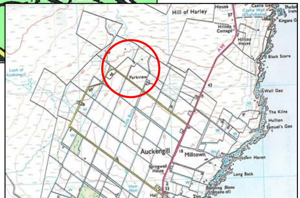
Plan reproduced from OS mapping under licence. © Crown Copyright applies